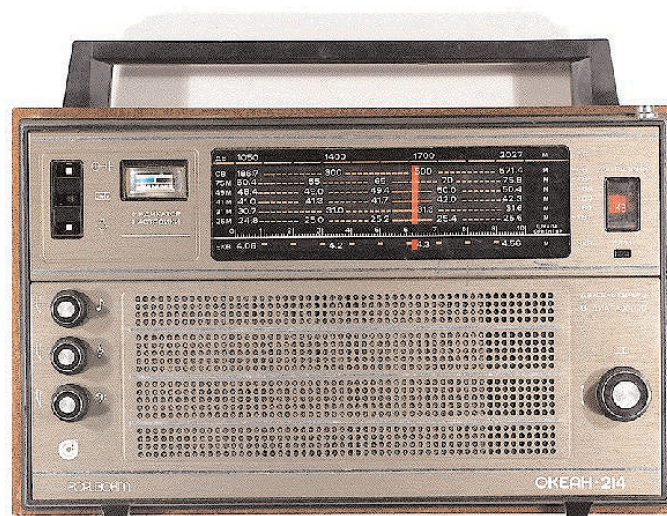
Fig. 1. The radio that has been used in this study.